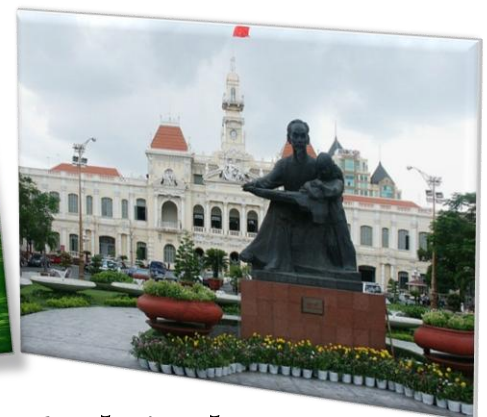
Ho Chi Minh City