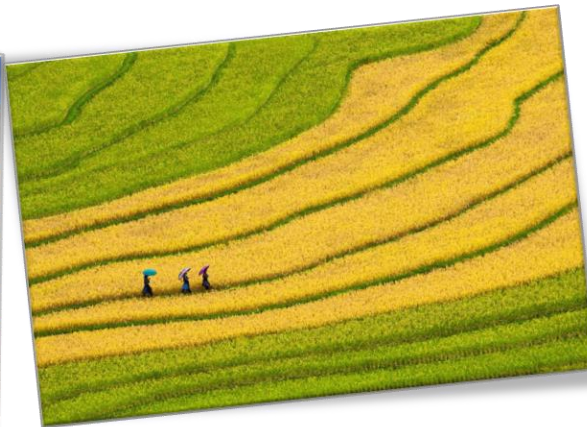
Sapa Rice field