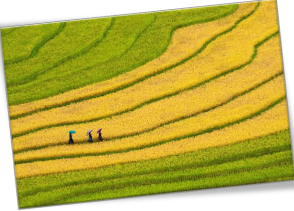
Sapa Rice field