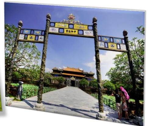
Hue Imperial Citadel