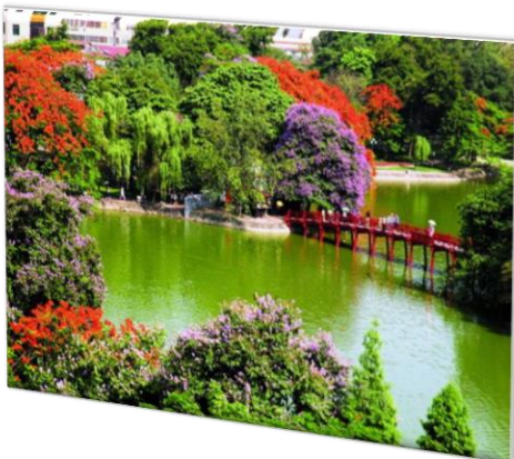
Hoan Kiem Lake