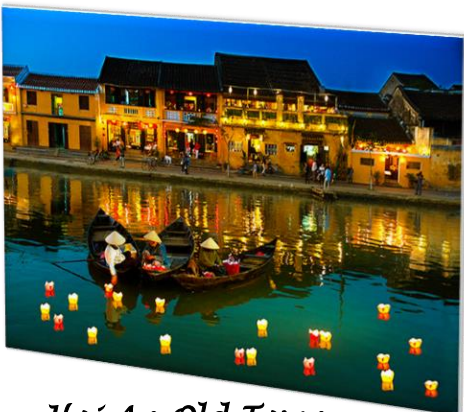
Hoi An Old Town

Hotel options: 2-star, 3-star Tour type: Group tour (Min. 2; Max. 16)