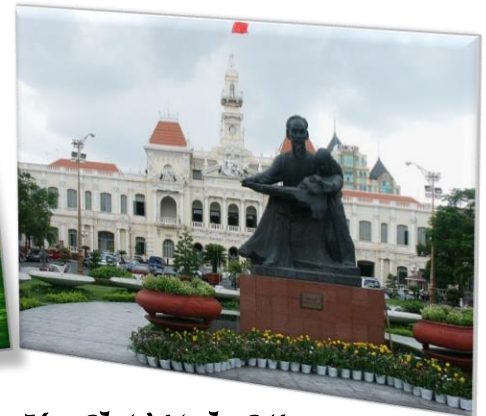
Ho Chi Minh City