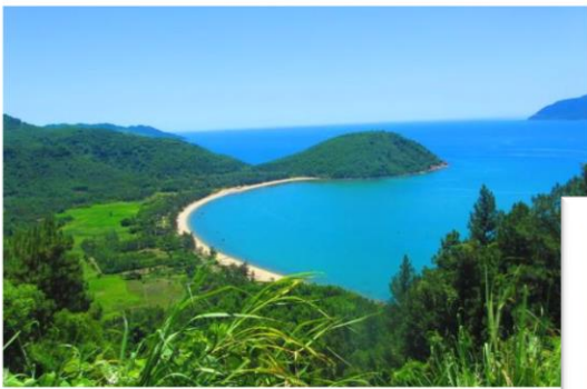
View from Hai Van Pass

Hotel options: 2-star, 3-star Tour type: Group tour (Min. 2; Max. 16)