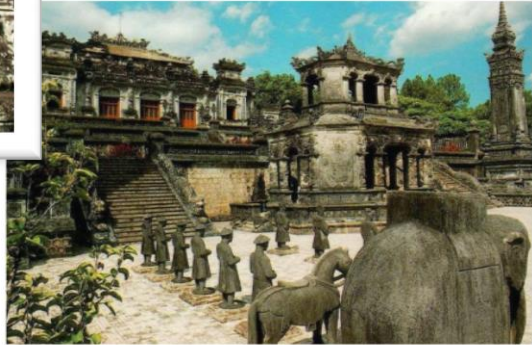
Royal Tomb in Hue