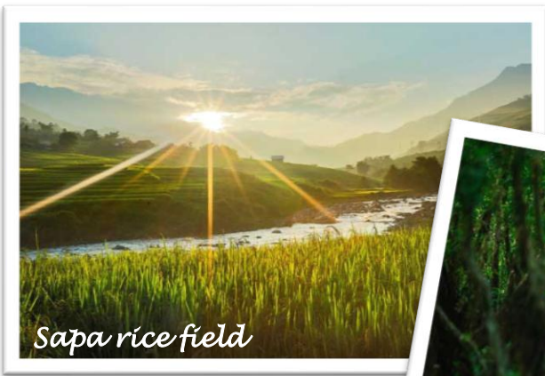
Sapa rice field